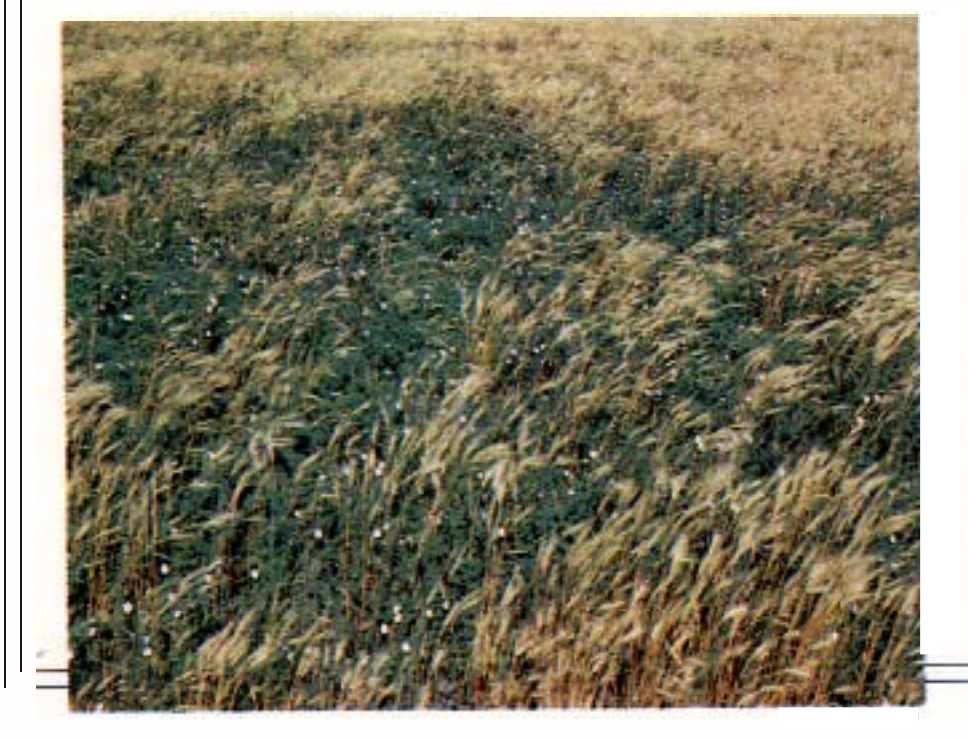
Although wheat is a better competitive crop than a summer-planted crop, field bindweed infestations can reduce wheat yields by 20 to 50 percent.

Tank mixtures of 2,4-D plus Banvel or Tordon and 2,4-D alone are widely used for controlling field bindweed during the fallow period prior to seeding winter wheat. In recent years, the use of Landmaster II or Landmaster BW has increased for the control of annual weeds and suppression of field bindweed in fallow. When possible, treatments should be made when bindweed is actively growing with runners 8 to 12 inches long and in mid to full bloom. Tordon plus 2,4-D at 0.12 to 0.25 0.5 to 1.0 lb/A should be applied at least 60 days prior to seeding winter wheat to avoid possible crop injury. Similarly, Banvel plus 2,4-D at 0.5 + 1.0 lb/A should be applied at least 45 days prior to seeding. Winter wheat can be safely seeded 2 weeks after rainfall of .5 inch or more following an application of 2,4-D or Landmaster products. Bindweed control is reduced when treated areas are tilled anytime after a Landmaster application.