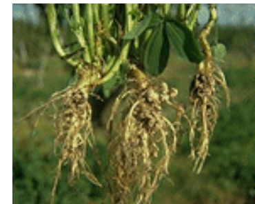
Sustainable Agriculture Research & Education, University of California, Davis