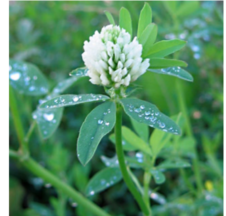
Wild Flowers of Israel, Trifolium alexandrinum