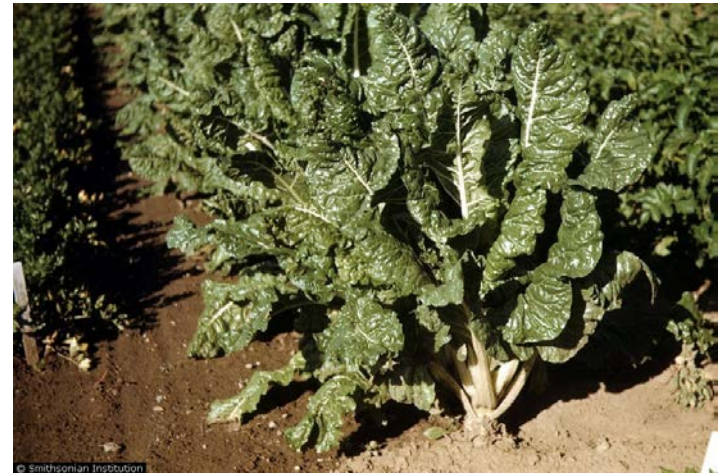
USDA, NRCS, PLANTS Database