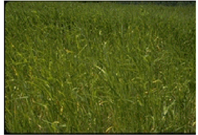
Sustainable Agriculture Research & Education, University of California, Davis