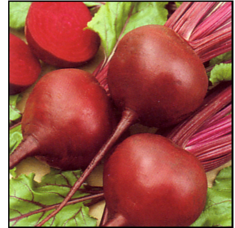
Augustus Oils Limited