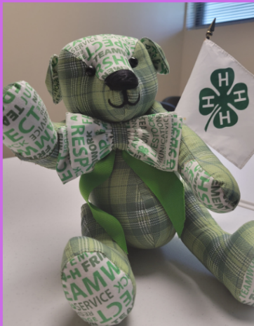
Drawing to take place during the achievement ceremony on October 16